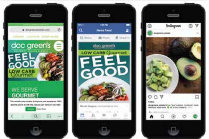
DIGITAL MEDIA PACKAGES AVAILABLE